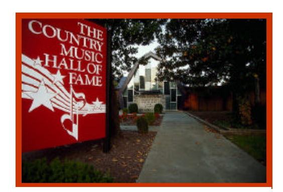
Nashville Here We Come!