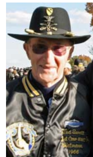
Garry Owen, Sir!

But in spite of his health he was determined to always be at our dinner the night before Veterans Day. This past November he was there. What a trooper. We will all miss him!!!