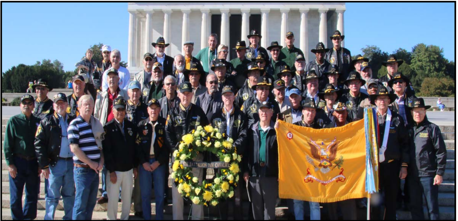
5th Battalion 7th Cavalry Association: 2014 Veterans Day