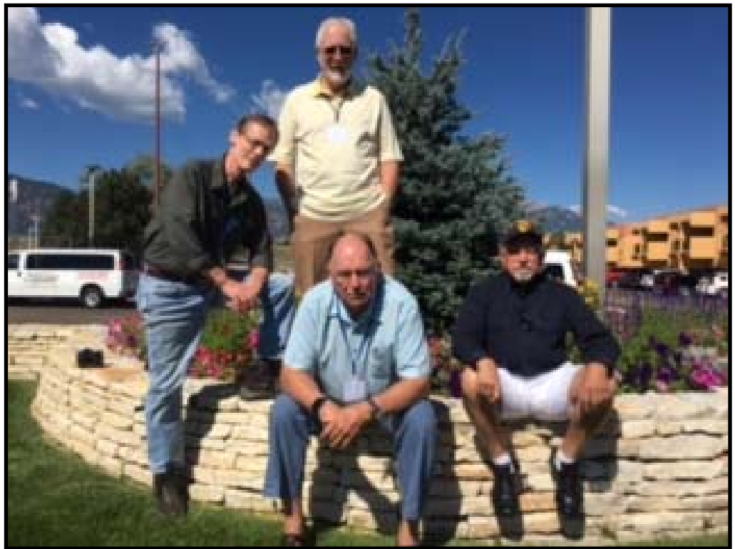
A walk in the past after 48 years