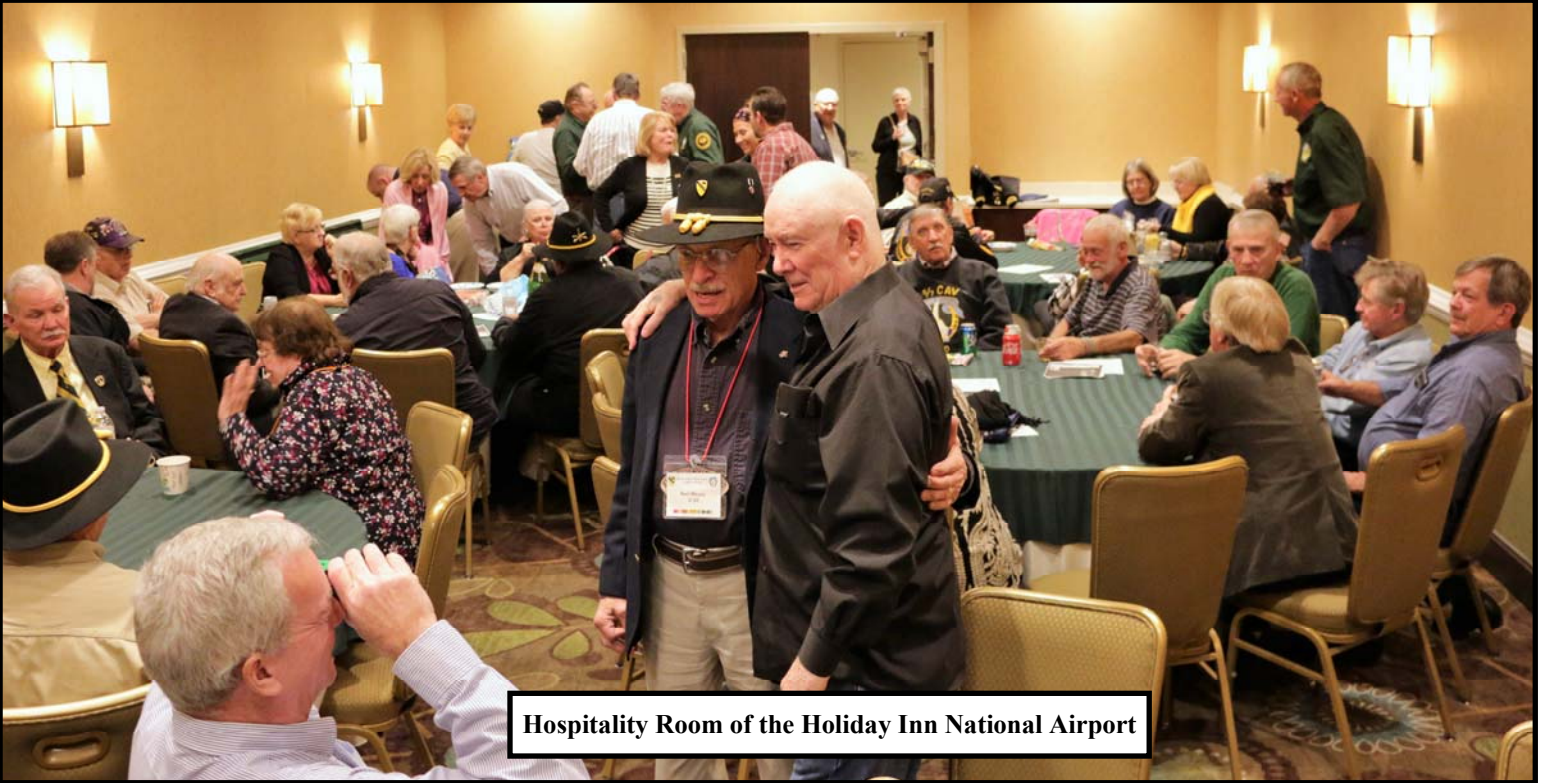
Hospitality Room of the Holiday Inn National Airport