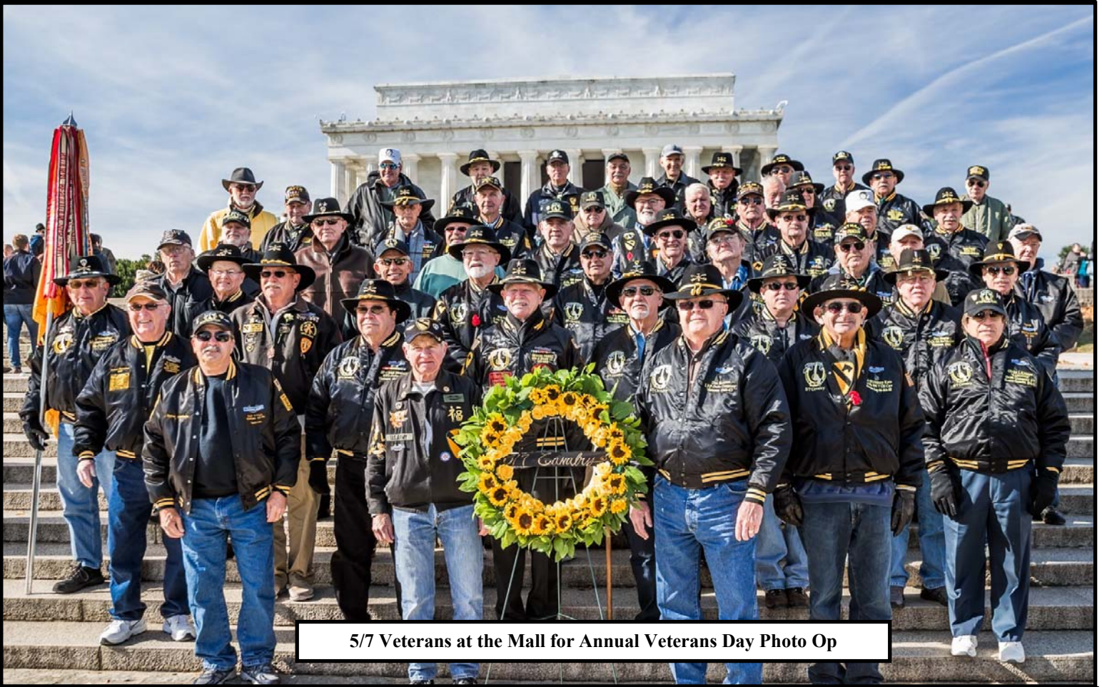
5/7 Veterans at the Mall for Annual Veterans Day Photo Op