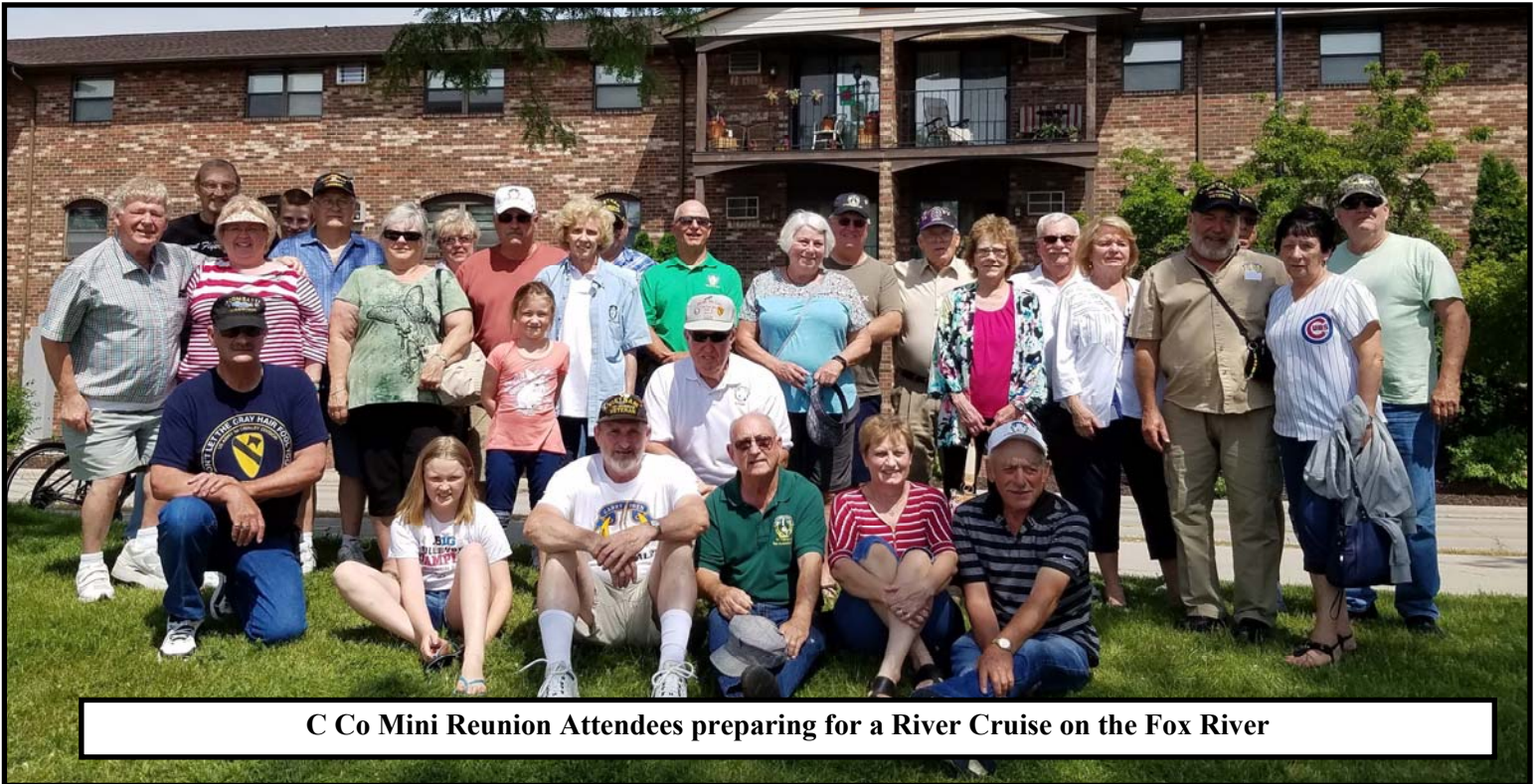
C Co Mini Reunion Attendees preparing for a River Cruise on the Fox River