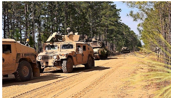
5/7 Cav Scouts lead tanks from 2/7 IN battalion through a passage of lines during the CALFEX