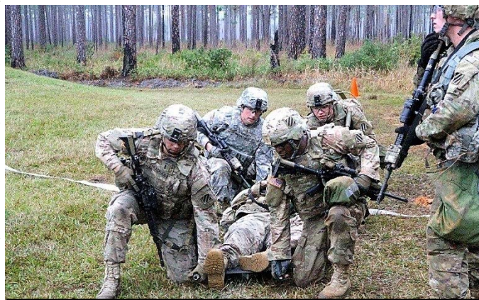
Troopers practice medical evacuation during spur ride

The staff is currently preparing to conduct their final simulated exercise which will be their last chance to practice before NTC. Troops have begun packing containers for transport to California. 5-7 Cavalry is ready to apply the expertise built through three rotations to Europe and the last four months of hard training at the National Training Center.