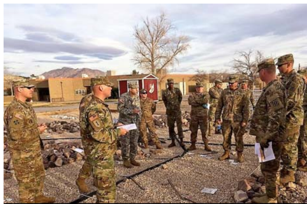
The staff rehearses an operation at the NTC during leader training program

On the horizon is the Squadron Change of Command, another NTC Rotation, and a deployment to Korea.