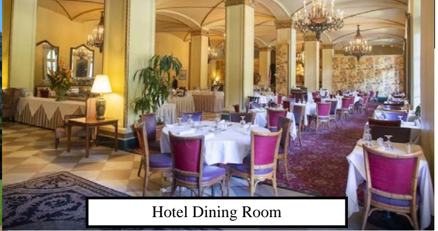
Hotel Dining Room

Members can check-in up to three days early and stay up to three days longer at our preferred room rate of $92.50, including a full breakfast during the reunion week. Breakfast will be served in the dining room shown below.