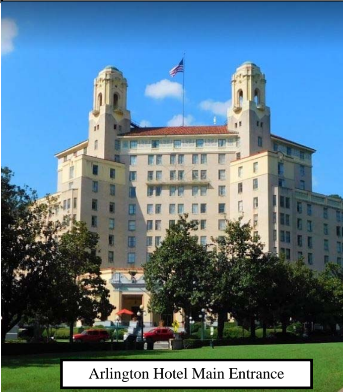
Arlington Hotel Main Entrance

This is a photo of our reunion hotel in the heart of downtown Hot Springs, Arkansas. This is the third incarnation of the Arlington. The first Arlington was built in 1875 and was replaced in 1893 with a new brick structure which lasted until fire destroyed the building in 1923. The third and current structure was completed in 1924. She is a grand structure that has seen many dignitaries and famous people housed and entertained in her grand ballrooms and restaurants.