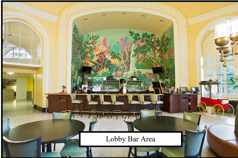
Lobby Bar Area

Members can check-in up to three days early and stay up to three days longer at our preferred room rate of $92.50, including a full breakfast during the reunion week.