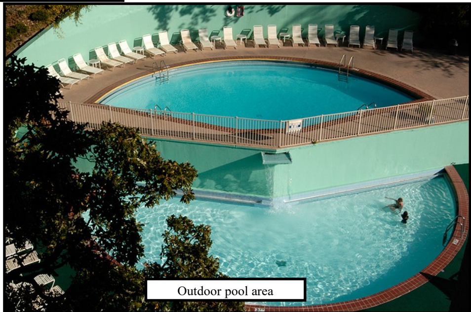
Outdoor pool area

https://www.reseze.net/servlet/SendPage?hotelid=1624&skipfirstpage=true&page=209463