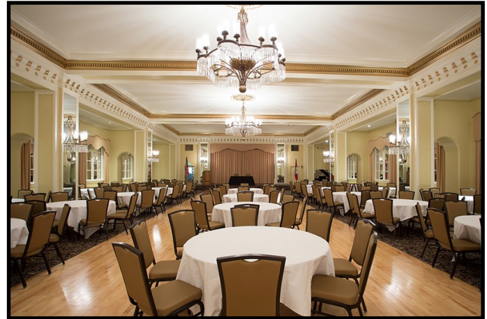
First Floor Dining Room

The hotel will accept room bookings now for the 2021 reunion. The reunion dates are Monday, July 19 through Saturday, July 24. You also have the option of booking three days ahead and three days after. The room rate throughout this period is $92.50.