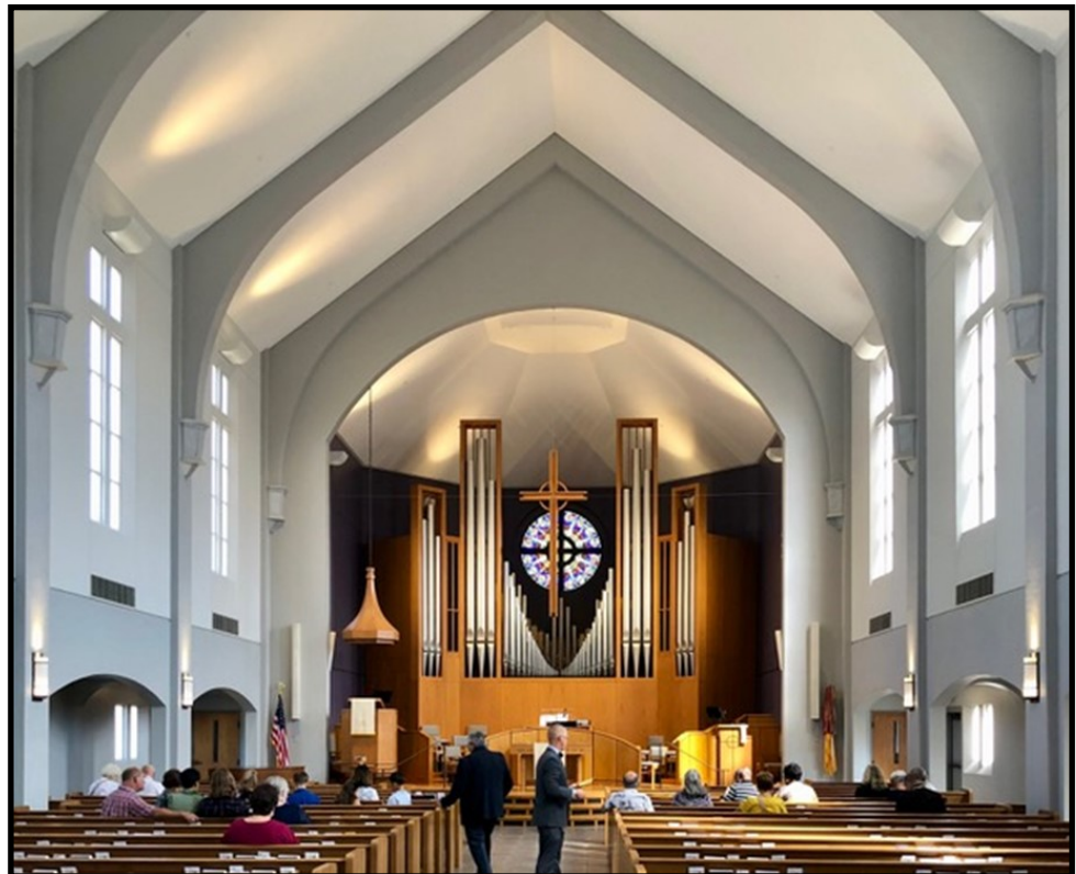
5/7 Cavalry Memorial Service