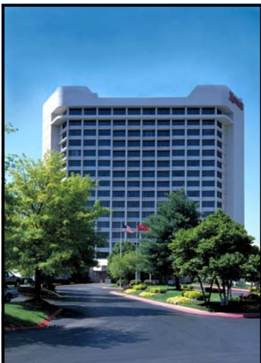
MARRIOTT NASHVILLE AIRPORT HOTEL