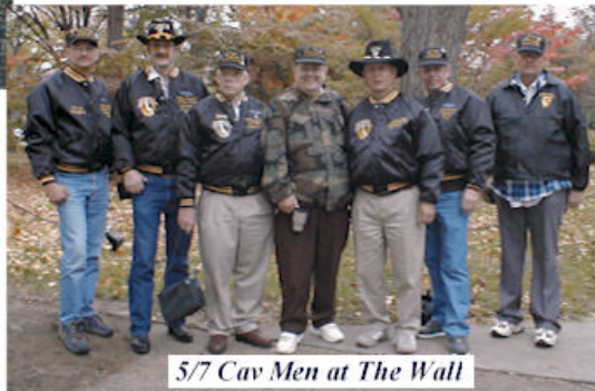
5/7 Cav Men at The Wall

Three of Our Fellow Troopers Who Gave All!