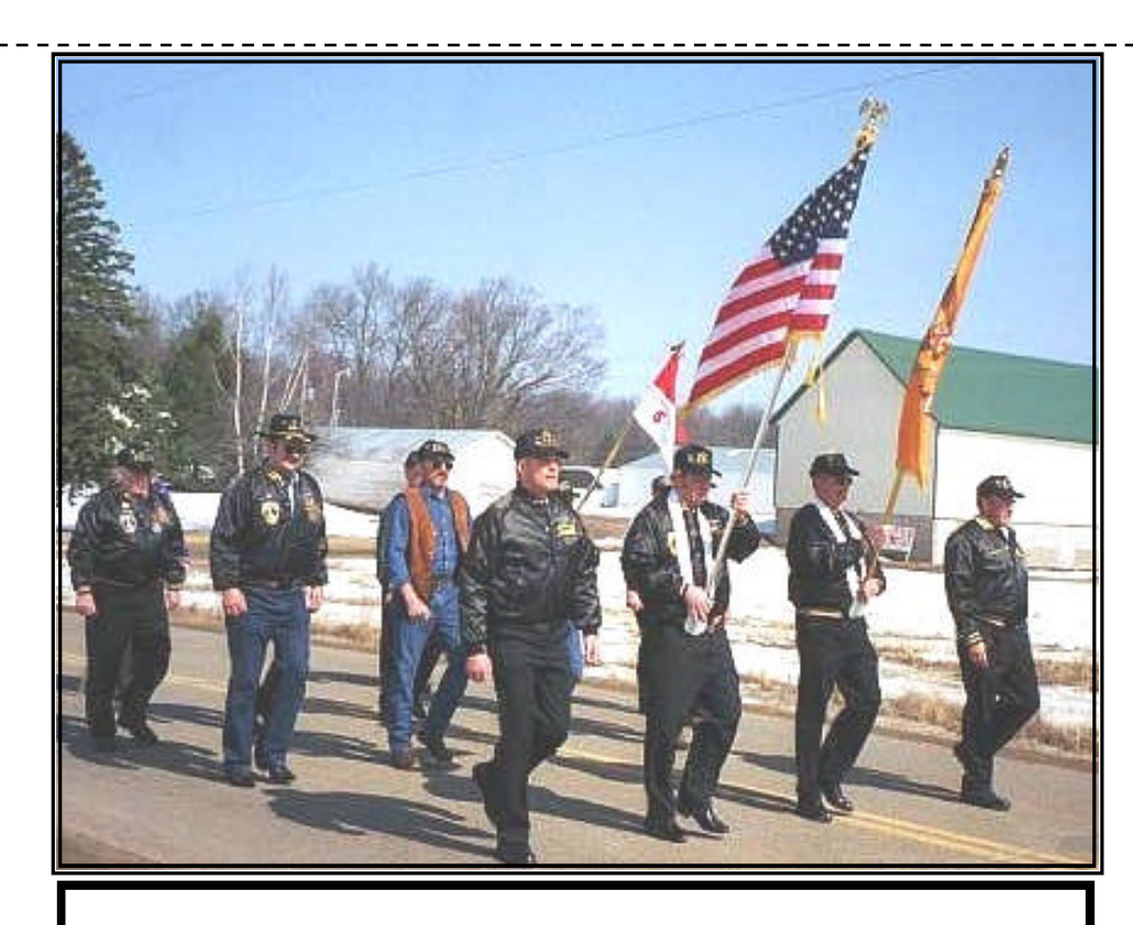
St. Patrick's Day Parade Pickerel, WI