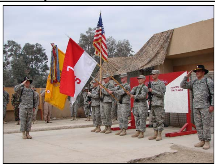
Rendering honors at Squadron headquarters on Camp Blue Diamond