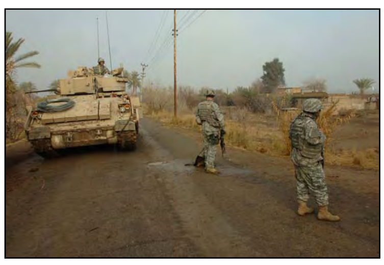
Soldiers from Apache Troop clear the way into Sayafiyah, Iraq

On January 22 we kicked-off offensive operations to clear our new area of insurgents and relieve an enclave of villages that had been fighting against Al Qaeda. For the first time in many months, all three cavalry troops were collocated and operating together. B Troop led the way by occupying and clearing what would become our new patrol base, a massive 500-man capacity facility built entirely by Army Engineers in a farmer's field. While Bandit provided local security, C Troop led the way in clearing the major route into the village of Sayafiyah. Assisted by A Troop, we reached our objective and accomplished all our assigned tasks within two weeks, a full month ahead of schedule! What our troopers were able to accomplish has been truly amazing, and I could not be more proud of our young men and women. We had a few guys get banged-up a bit, but casualties were very light and the mission much more successful than we could have hoped for.