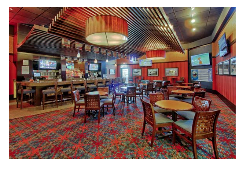
Rawhide Bar & Grille