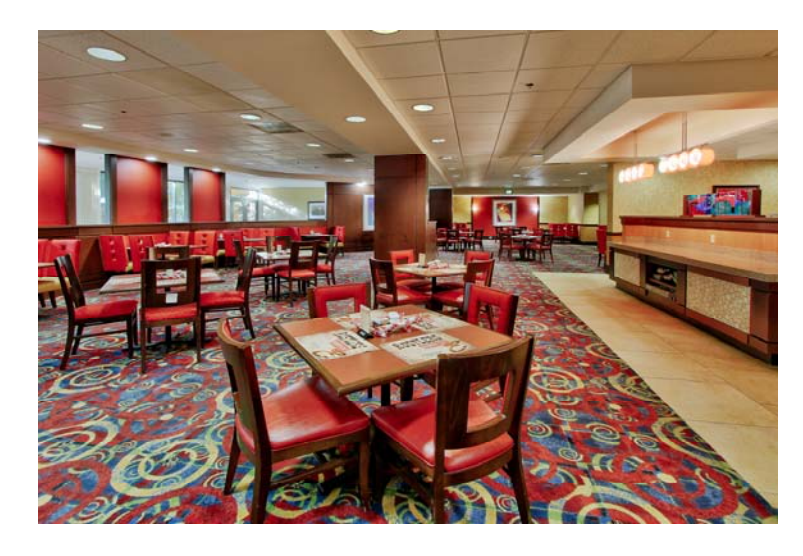
Rustler's Café Restaurant