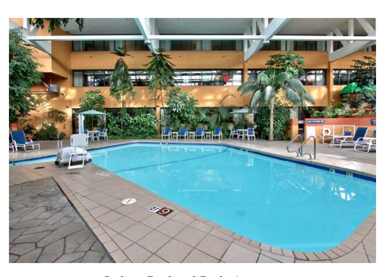
Indoor Pool and Patio Area