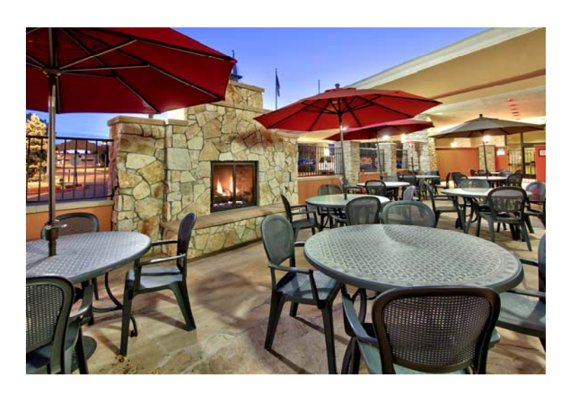
Outdoor Patio Bar