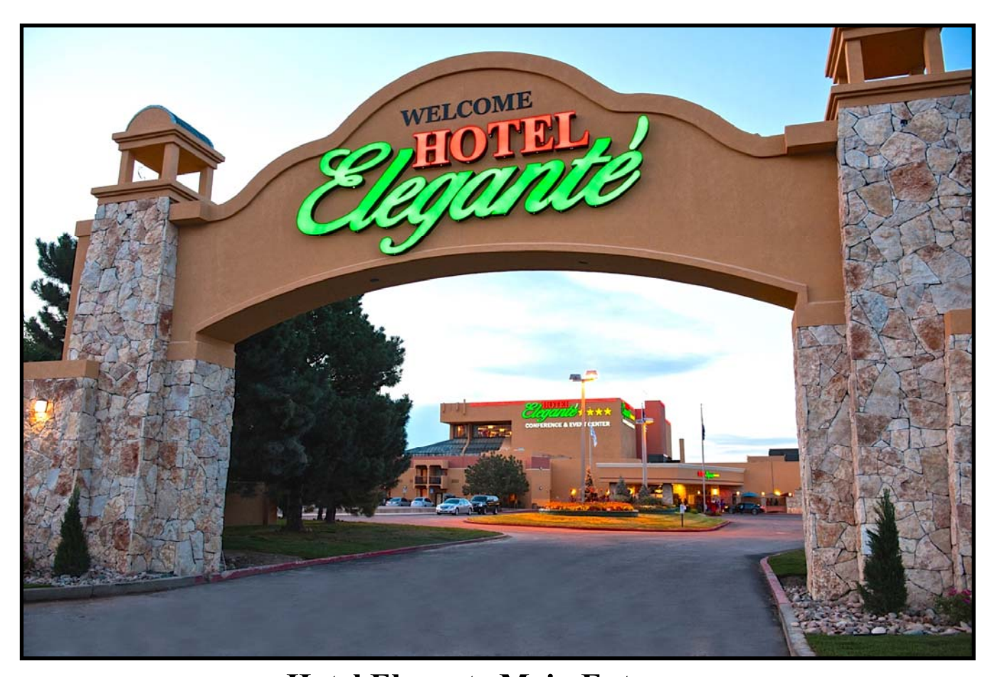
Hotel Elegante Main Entrance

The hotel Elegante has 500 rooms, two swimming pools, one inside and one outside, a fitness center, very spacious meeting space, two restaurants, an ice cream parlor and a spectacular hospitality room with a view of Pikes Peak and the majestic Colorado Rocky Mountains.