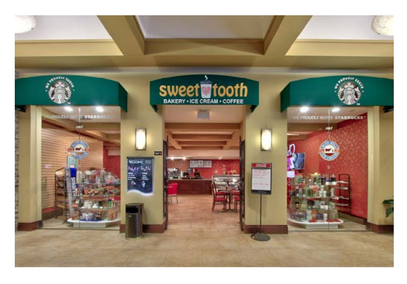
Sweet Tooth Ice Cream Parlor