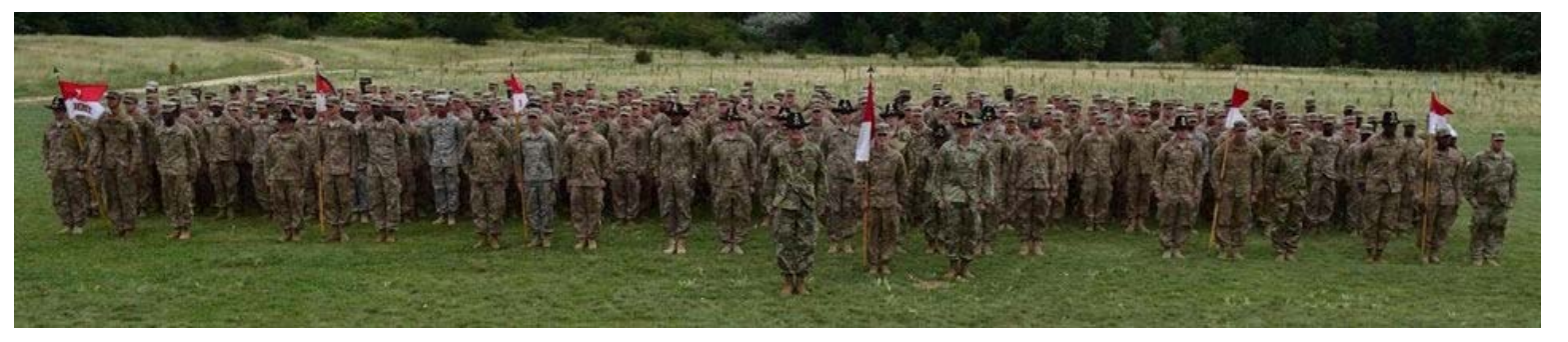
5th Squadron, 7th Cavalry in our last formation together before redeployment to Fort Stewart, GA