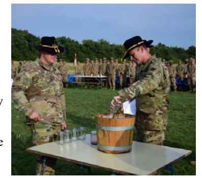
CSM Bolyard adds to the grog