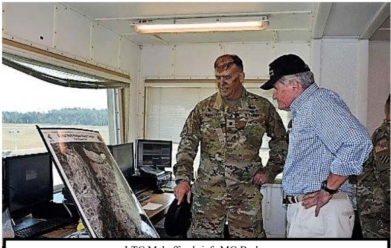
LTC Mahaffey briefs MG Budge

days of grueling testing including a stress shoot, day and night land navigation, skills testing lanes, a written test, and numerous physical challenges culminating in a twelve mile road march. In total, 88 Troopers earned their spurs which were presented at a spur dinner in 5-7 CAV's new motor pool.