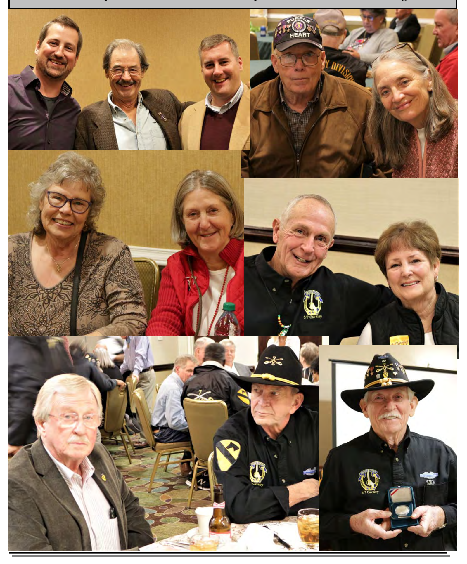
2018 Veterans Day Photos - More Veterans Day Photos are on the cav57.org web site