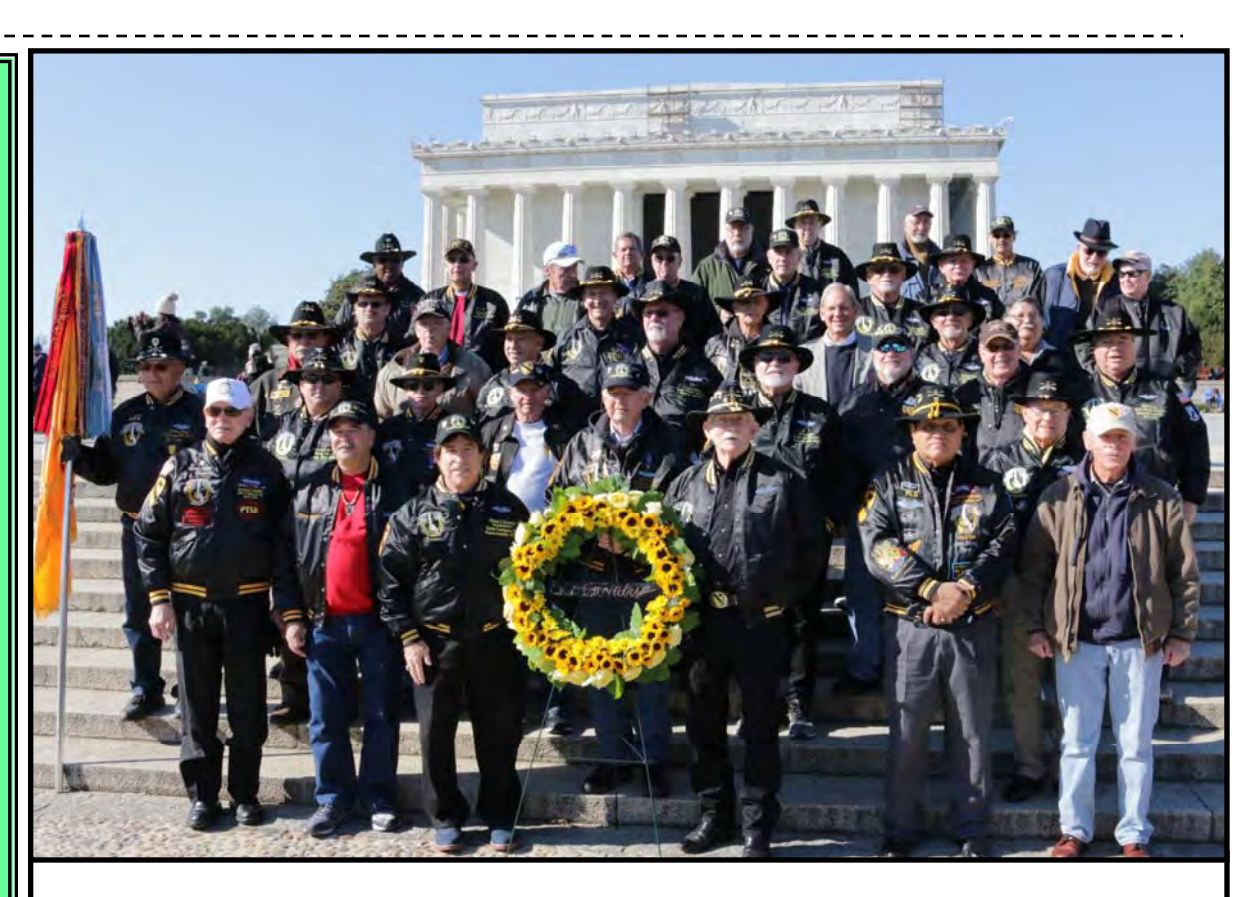
2018 Veterans Day