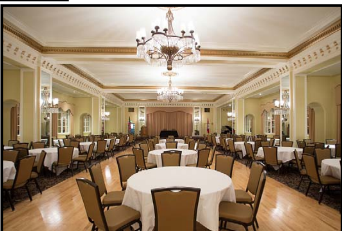
First Floor Dining Room