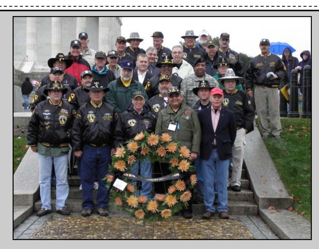
VETERANS DAY, 11/11/2009, Washington, DC