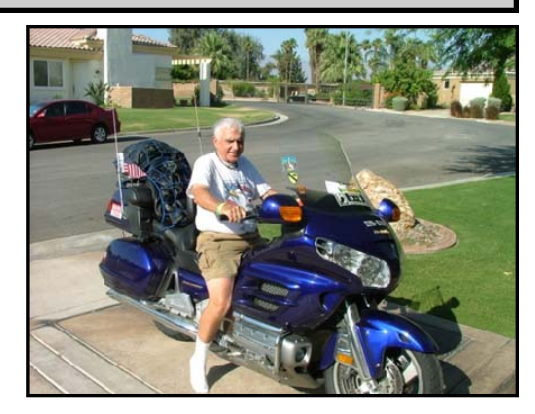
The "Duke," on Krazy's bike in California.